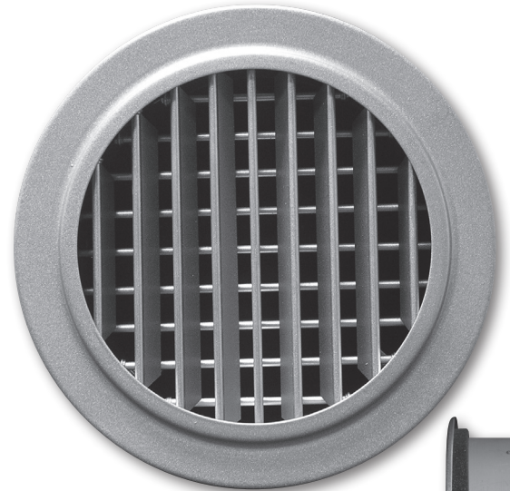
R5880 (Face & Side View)